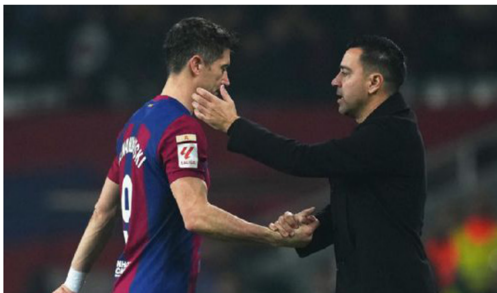
Barcelona Player Robert Lewandowski and Coach Xavi

Arteta and Márquez are just two of the many names to have been linked with the vacancy since Xavi's revelation, with sources telling ESPN a replacement is unlikely to be picked immediately as Barça carry out a thorough recruitment process. ESPN